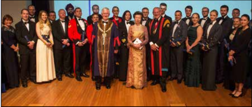
PRINCESS ANNE WITH 2017 WINNERS

To grow our Trust fund at an accelerated rate, the trustees will continue to leverage support through regular giving from members of the livery, legacy, one-off giving and socially responsible investment, as well as looking at how the Trust might develop beneficial corporate partnerships in the future.